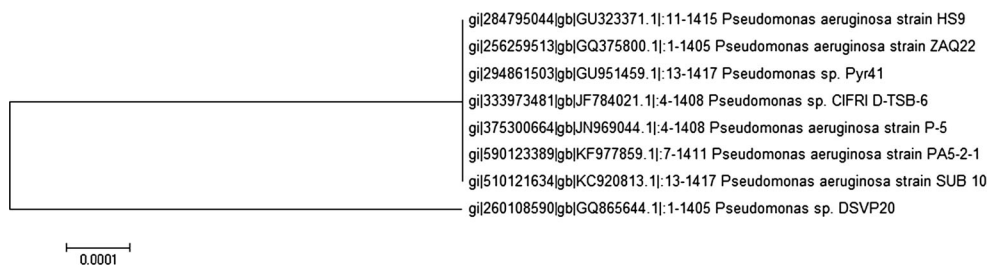
Fig. 1 Neighbour-joining phylogenetic tree of the strain DSVP20 based on 16S rRNA gene sequence comparisons and closest NCBI (BLASTn) strains based on the 16S rRNA gene sequences (neighbor-joining tree

Members of the genus Pseudomonas have a complex enzymatic system and show a wide variety of physiological and metabolic properties. Similarly, they are the most predominant group of microbes that degrade xenobiotic compounds. It is well documented that various bacteria from genus Pseudomonas , including P. aeruginosa strains, inhabit hydrocarbon-contaminated soils and can break a wide range of different organic compounds (Glick et al. 1994; Hong et al. 2005; Saikia et al. 2012; Pacwa-Płociniczak et al. 2014). They are the well-known bacteria that have the capability of utilizing a number of aliphatic and aromatic hydrocarbon compounds as a carbon and energy sources (Das and Chandran 2010; Kadali et al. 2012; Puškárová et al. 2013). Monitoring of maximum biosurfactant production and reduction in surface tension during growth of P. aeruginosa DSVP20 on pristane, eicosane, and fluoranthene at intervals of 24 h revealed that with increase in dry biomass, there was a reduction in