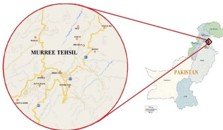
Fig 1: Map showing the study area, Murree and its vicinity.

In our study the relative abundance of Apis cerana F., A. mellifera L. and A. dorsata F. was observed 84.78%, 13.04%, 2.17% respectively (Fig.2).