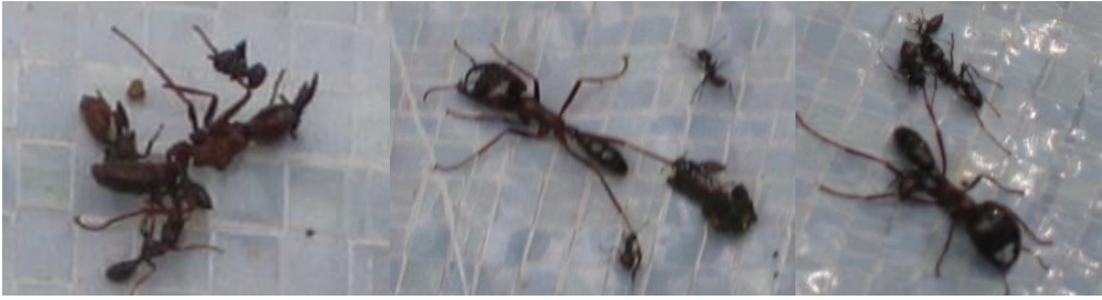
Fig. 3. The co-operation among C. chiarinii workers in group fighting with D. quadratus (the larger Dorylus (media morph)).

In all fighting, most of the C. chiarinii were observed fighting and moving with strong abdominal curling, suggesting the use of some sort of chemical repellent. The immediate disintegration and the retreat of the whole mass of the D. quadratus , may indicate the complemented of the physical fighting with chemical release by C. chiarinii . The strong conflict between the two ant species may arise from a great capacity of C. chiarinii to defend its nest territory and its brood from the nomadic carnivorous Dorylus that raids other ants and honeybee nests in search of its food. Raiding, defense of foraging territories and intra- and inter-specific disputes among various ant species have been well documented (Tschinkel et al. , 1995; Adams, 1998; Zee & Holway, 2006). The defence capacity underlines the potential, of C. chiarinii as biological control against D. quadratus swarms that attack honeybee apiaries.