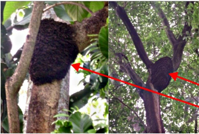
Fig. 1 Carton nests of Crematogaster chiarinii on trees (height about 5 m above the ground).

In this study, the potential of C. chiarinii as a biological control agent against D. quadratus : the mode of the aggressive reactions between the species; how many hives can be protected by a single C. chiarinii colony and possible ways of its artificial propagation were studied and reported.