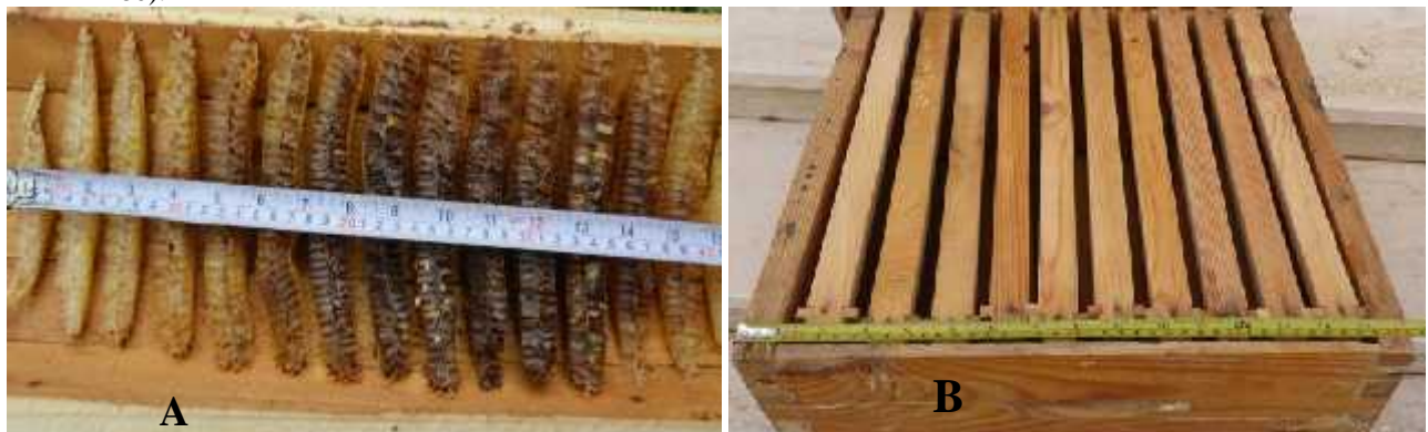
Fig. 3 The average number of combs (14) built per 40cm length in log hive (A), which is the same length used to keep only 10 frame combs in box hive (B).