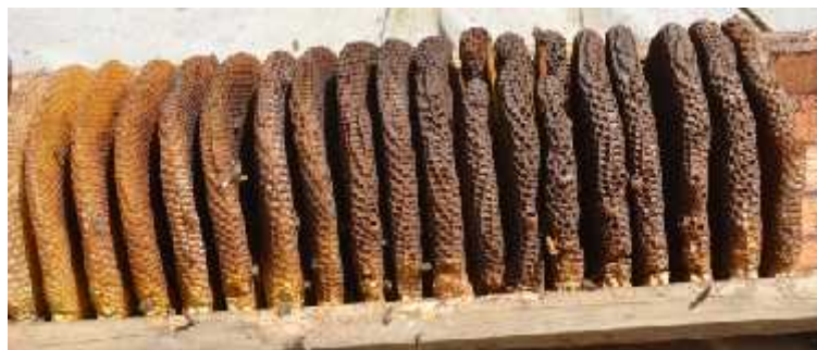
Fig.1 Log hive with fully built combs used for measuring total surface area of combs in a traditional log hive.

The average comb surface area of the race was estimated based on surface areas of combs built in 111 different log hives. For each hive the comb surface areas were calculated by taking the average comb radius then multiplying by the number of combs built by the colonies. The numbers of combs were counted after the colonies were transferred from log hives into box hives for other research purposes (Fig.1).